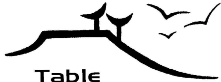
Table Mountain Association