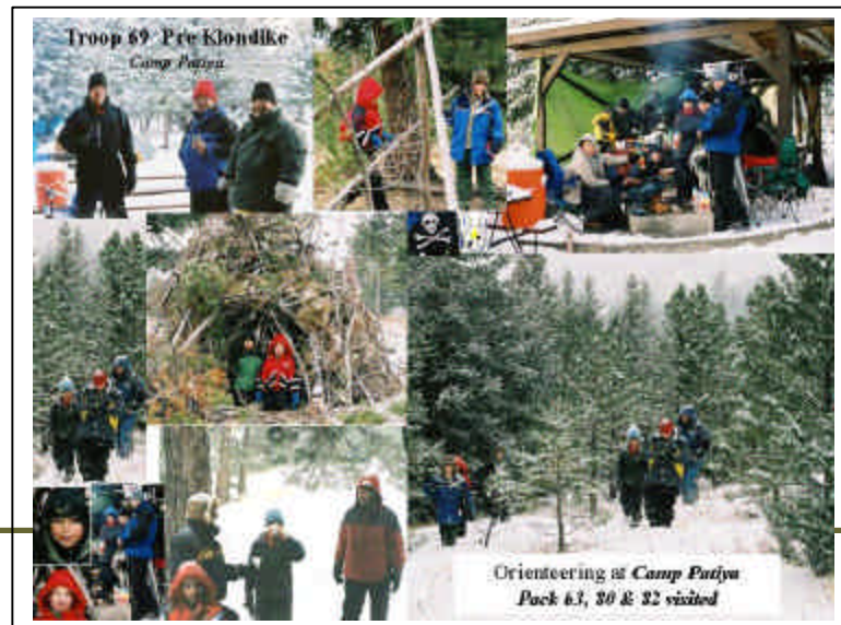
Troop 69 Pre-Klondike Camp Patiya