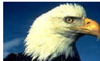
The American Eagle